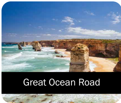
Great Ocean Road